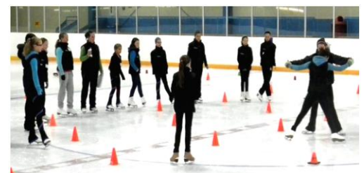
LSC Holds PA Training Session