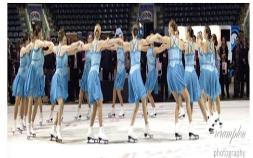
LSC Skaters Participate in Summit