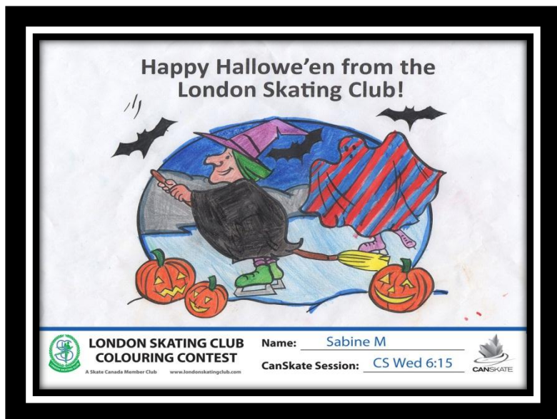
1 st Place Sabine M. Canskate Wed. 6:15 Session