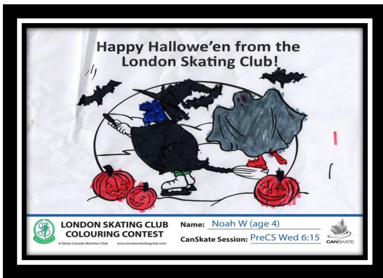
2 nd Place Noah W. PreCanSkate Wed. 6:15 Session

Thanks to everyone who participated! Keep up your hard work and we look forward to all the amazing entries next month!